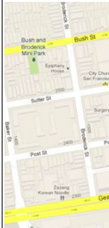
Mount Zion Map and Route.pdf [2]