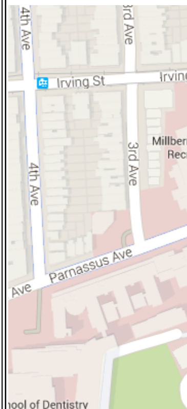
Moffitt-Long Hospital Ma